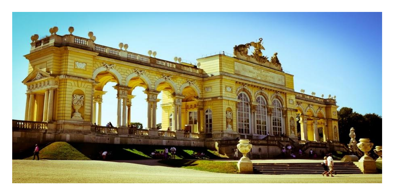
Day 22 - Vienna: You have a 3-day pass for all local transport in and around Vienna. Spend the day visiting the Imperial Palace and the magnificent baroque palace Schoenbrunn. Visit the colourful Hundertwasser village with its 'Toilet of Modern Art'. Try and taste-test as many light and flaky applestruddles or sweet dumplings as you can and still walk back to the hotel – or the next atmospheric wine tavern. See Vienna options for extra sightseeing and extensions on our website.

Day 23 - Prague: After a delightful train journey through the bohemian countryside spend the afternoon and evening and familiarize yourself with this UNESCO World Cultural and Natural Heritage listed inner city and its amazing architecture, winding streets and famous sights.